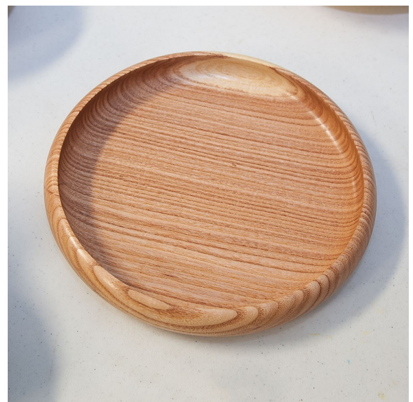
Kevin Bierman-Coffee Bean- Antique Oil