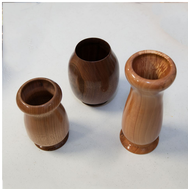
Ton Nehl-Butternut, Apple, Walnut-WOP