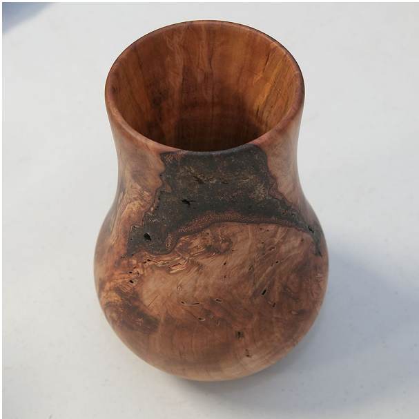
Trint Adams - Cherry