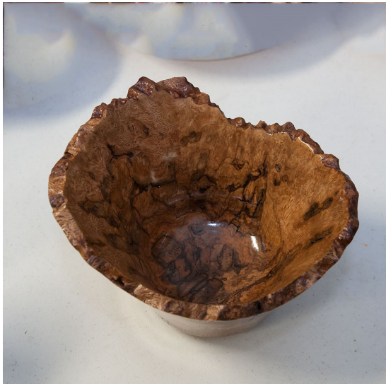
Dean Sherman-Oak Burl-Salad Bowl