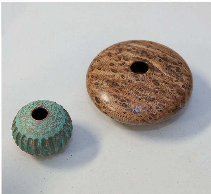
Greg Ellyson-Maple-Metal Effect Paint Pin Oak-Oil